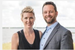
GAULT 6:00pm No Childcare Place: Gault Home, Clinton