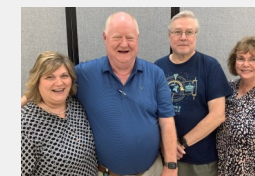
GARNER/WALLACE 6:30pm No Childcare Place: Garner Home, Brandon

Please see the QR CODE for specific meeting times and locations.