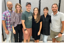
OWENS/SHULER/ HOOD 5:30 pm Childcare provided (call ahead) Place: Owens' Home, Jackson