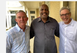
McCAY/POLLARD/ SIMPKINS 6:30pm; Childcare provid- ed (Redeemer programs) Place: Redeemer Church Jackson