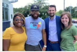
KING/McNEIL 5:30pm No Childcare Place: Redeemer Church