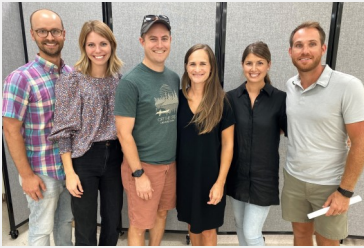
OWENS/SHULER/ HOOD 5:30 pm Childcare provided (call ahead) Place: Owens Home, Jackson