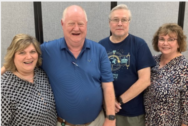
GARNER/WALLACE 6:30pm; No Childcare Place: Garner Home, Brandon

Please see the QR CODE for specific meeting times and locations.