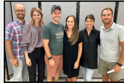
OWENS/SHULER/ HOOD 5:30 pm Childcare provided (call ahead) Place: Owens Home, Jackson