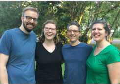
VICKERY/ROWAN 5:45pm No Childcare Place: Vickery Home, Jackson