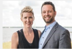
GAULT 6:00pm No Childcare Place: Gault Home, Clinton

6:30pm; Childcare provided (Redeemer programs) Place: Redeemer Church Jackson