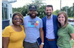
KING/McNEIL 5:30pm No Childcare Place: Redeemer Church